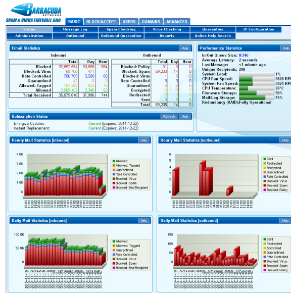
The Barracuda Spam & Virus Firewall Vx filters all email messages and displays the number of emails received with statistics on how they were processed.

The Barracuda Spam & Virus Firewall Vx is available in four editions handling up to 10,000 email users. Multiple Barracuda Spam & Virus Firewalls can be clustered for more capacity and high availability.